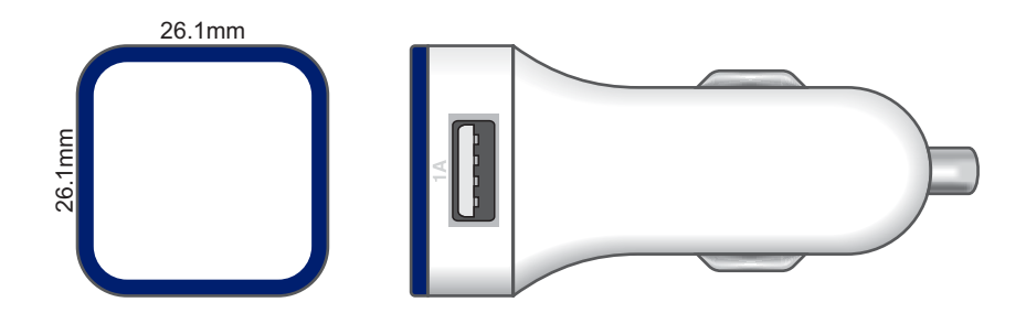
100% of Actual Size Resin Coated Finish